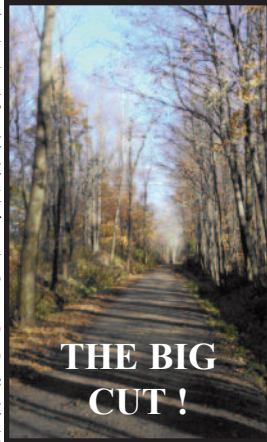
THE BIG CUT!