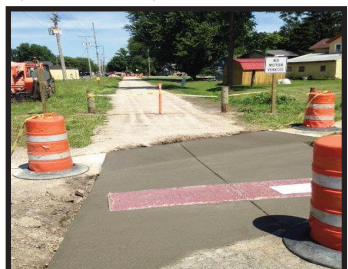
Spring posts are installed and smooth concrete aprons are poured at the roads.