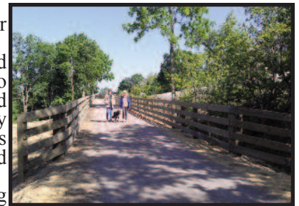
First ones down the ramp! The new trail awaits you as well!

The trail is now open for use! The Grand Opening Celebration and Dedication will be held at the bridge and adjacent Donald E. Morrow Park and Depot on Sept. 23.