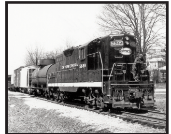
These two first generation units are mechanically identical. The F7A at left was quickly improved to provide better access and visibility with an external walkway: Namely a GP7. Howard Ameling