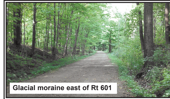
Glacial moraine east of Rt 601

All over the United States such linear parks are being developed for recreational use. Your support of this trail system will provide a safe, clean, and picturesque route for bike riders, walkers, joggers and rollerbladers. The NCIT is also the only public equestrian trail in Huron County.