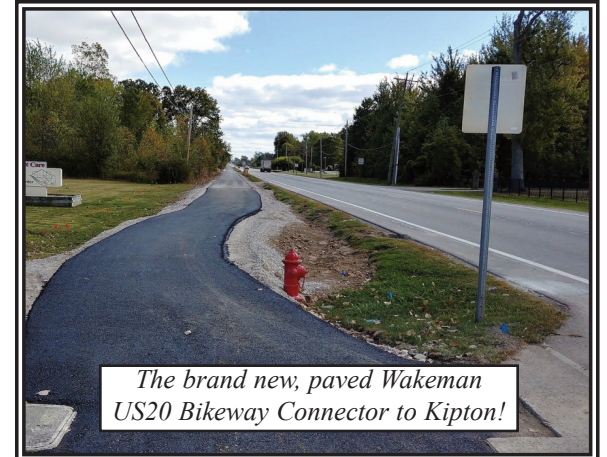
The brand new, paved Wakeman US20 Bikeway Connector to Kipton!

WAKEMAN - COLLINS - NORWALK- MONROEVILLE - BELLEVUE