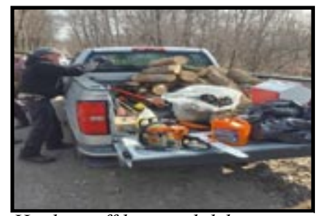
Hauling off logs and debris...