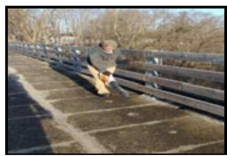
Blowing off the bridge decks, and...