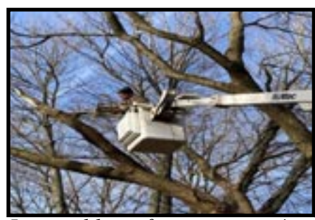
Lots and lots of tree trimming!