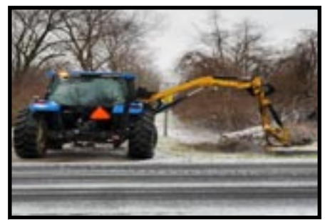
Ditch mowing at Collins...

Just because bears hibernate during the winter doesn't mean we do! Winter is when we do so much work to get the trail ready for spring - and the time is now to get out and ride and run and walk. The trail looks A-1 and we have begun our mowing rotations - all volunteer - running five tractors across the entire county. Here's a look at some of the work performed this winter. We hope you enjoy the trail thanks to the efforts of so many.