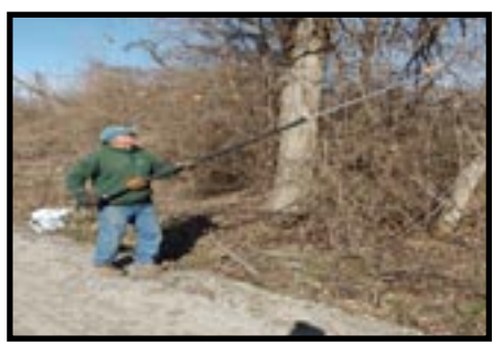
Removing limbs and vines...