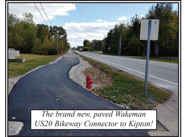
The brand new, paved Wakeman US20 Bikeway Connector to Kipton!

WAKEMAN - COLLINS - NORWALK- MONROEVILLE - BELLEVUE