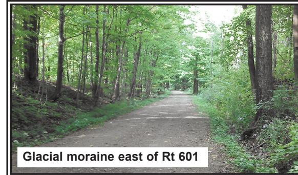
Glacial moraine east of Rt 601

All over the United States such linear parks are being developed for recreational use. Your support of this trail system will provide a safe, clean, and picturesque route for bike riders, walkers, joggers and rollerbladers. The NCIT is also the only public equestrian trail in Huron County.